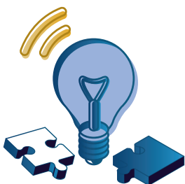
Share Knowledge and Collaborate

Accelerates the success of its members through proactive leadership and participation (leave rest of sentence blank for now) enables members to: