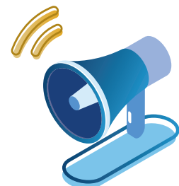
Corp Social Responsibility