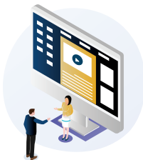
Virtual and Physical Events

Serves as an ideal source for event collaboration opportunities. Therefore, members are encouraged to both attend and host events within The Business Hub; members are free to use communal spaces for any event type without the hassle of planning, organizing, or executing it.