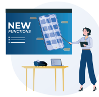
Product Launch Events