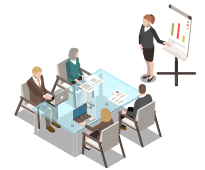
Conference Style Rooms