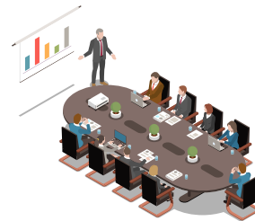
Board Style Rooms

Members are welcome to utilize modern conference and board rooms as their own. Private, spacious, and fully equipped rooms that are readily available for members to host all types of meetings.